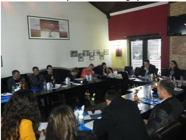
Workshop, March Gjakovë