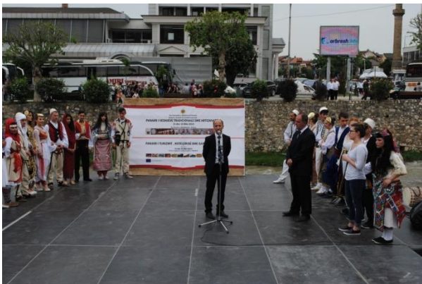
Festival in Prizren June 2015