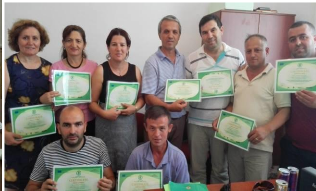
Issuing training certificates