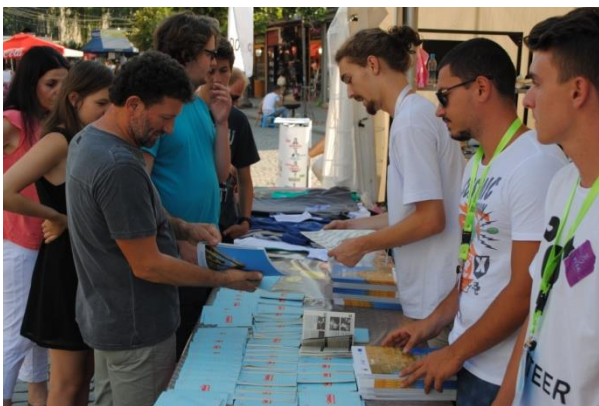
Presentation of atlas and food during the festival, June Prizren