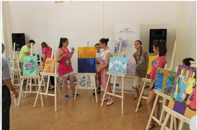
Theatre group “Avni Rustemi” Zallq-Istog April 2015; Activity “Meet up” 14.06.2015 Gjakovë