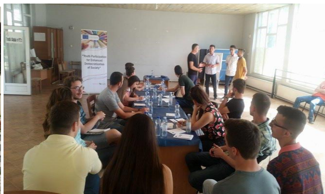
Training session Prizren