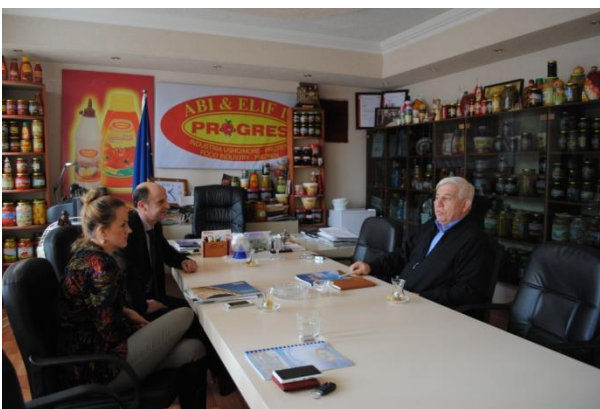
Visit to business in Prizren