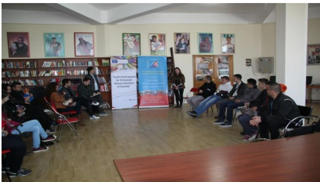
Study Visit Kukës American Corner