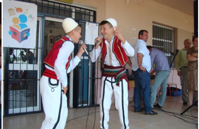
School “Ali Ibër Neza” Tropojë, Activity “Exhibitions” 1 st of June 2015