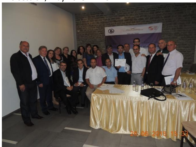
Issuing certificates, Workshop June 2015 Prizren;