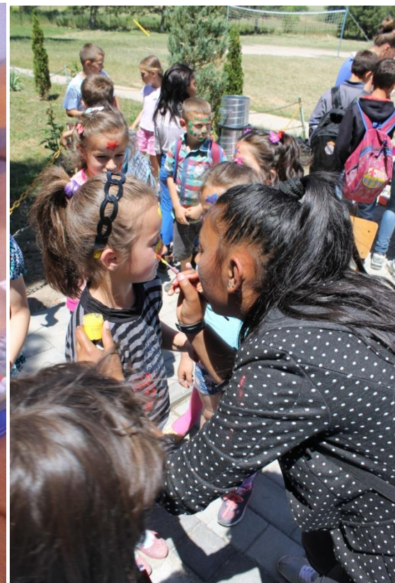
Art group “Ismet Rraci” Klinë, March 2015 & Art group “Exhibition” “Avni Rrustemi” Zallq-Istog 03.06.2015