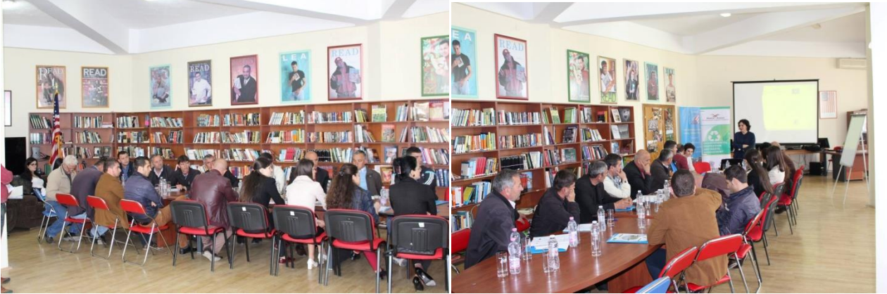
Training in “Capital Investment Planning on Waste Management” in Kukes

During the training on Environmental Protection, Waste Management, Recycling and Composting in Kukes with the students and lecturers from the University of Kukes