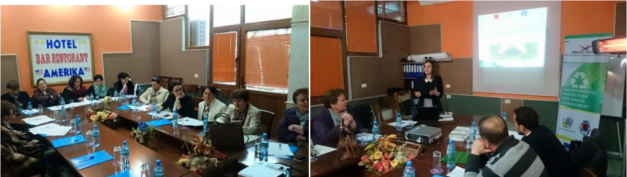
Training of teachers at “Hotel America” in Kukes

Activities of ATRC presented through photos: