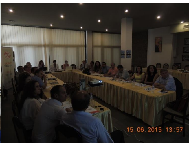
Workshop June 2015 Prizren