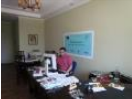
Establishing local offices