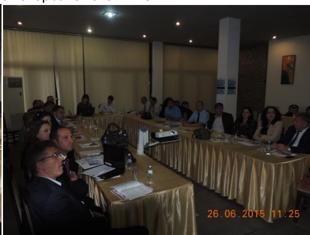
Expert presentation Workshop June 2015 Prizren