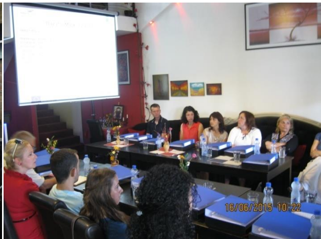
Workshop, June Gjakovë