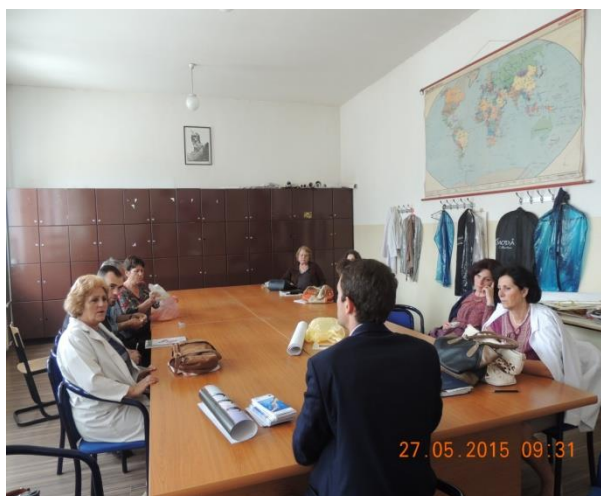
Info session, May 2015 Prizren