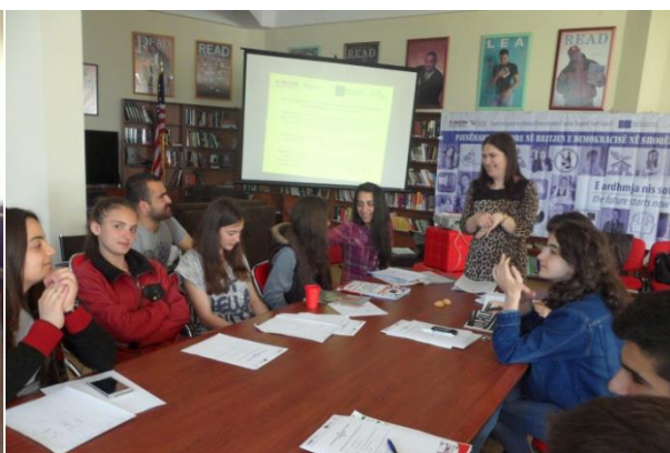
Training at American corner Kukës