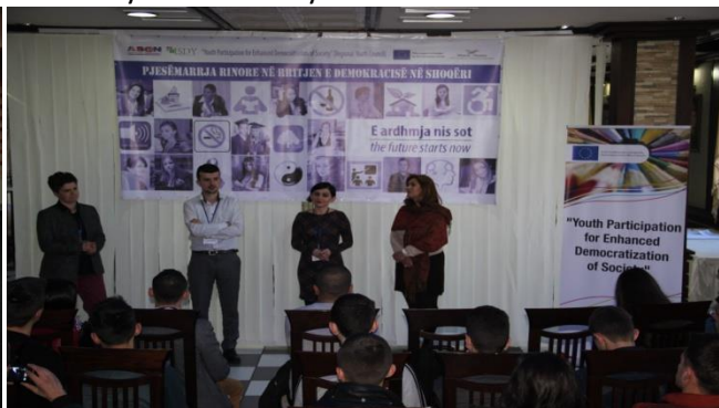
Training session Prizren