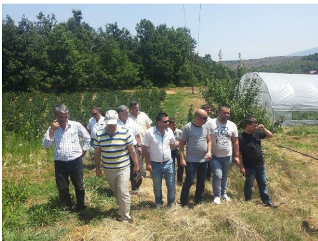
Visits with stakeholders to different farms