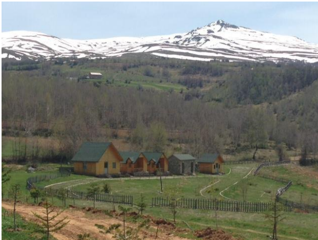
Visit to ECO camping in Shishtavec