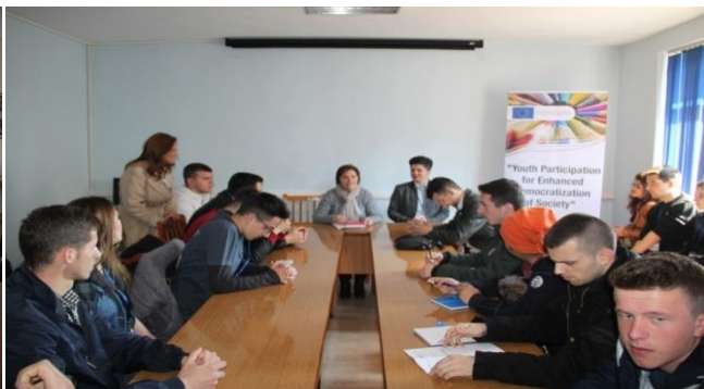
Study Visit Ministry of Education Kukës