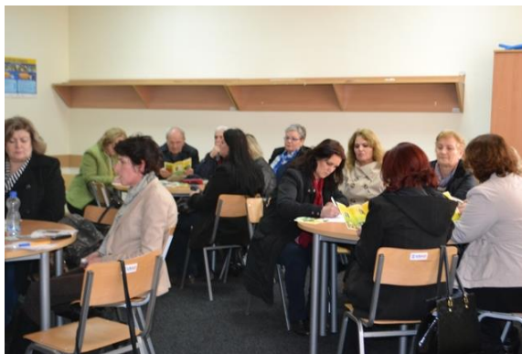
Figure 5 Training with teachers at elementary school "EMIN DURAKU "on May 5, 2015