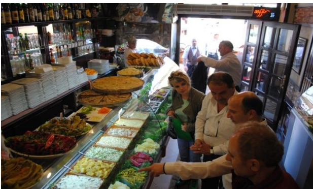
Monitoring visits in Prizren