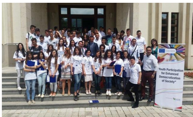
Study Visit Prizren