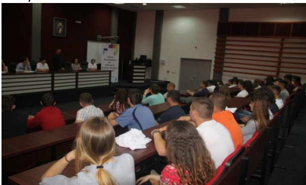
Study Visit Prizren University