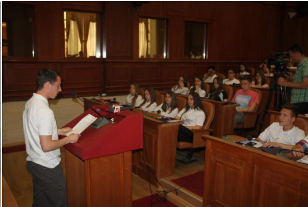
ISDY offices in Prizren and meeting with staff representatives