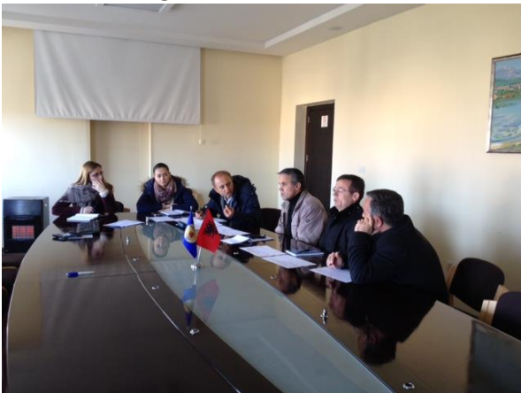
Training of the interviewers