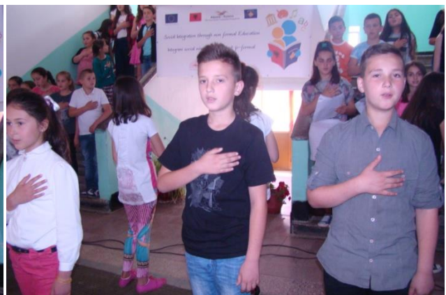
School “Besëlidhja e Malësisë” Bajram Curr, Activity “Exhibitions” 1 st of June 2015