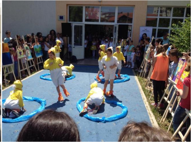
Art Group “Xhemajl Kada” Pejë, April 2015 & Dance group “Exhibition”, 01.06.2015 “Emin Duraku” Gjakovë