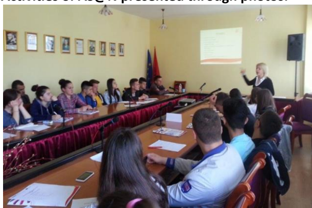
Training “Erasmus + Youth in Action”