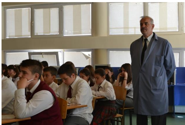
Figure 3 Training with pupils and teachers at elementary school "Martyrs of Zhur "on April 24, 2015