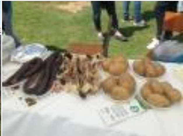
Eco products Shishtavec