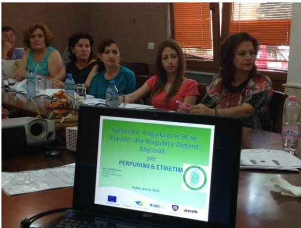
Training of trainers