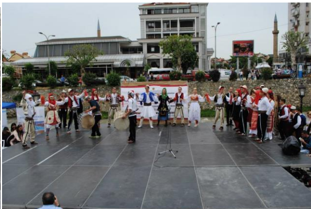
Festival in Prizren June 2015